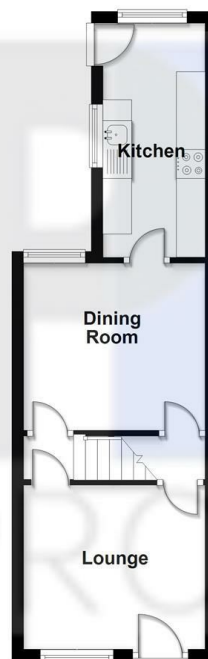
Ground Floor Approx. 28.5 sq. metres (306.2 sq. feet)